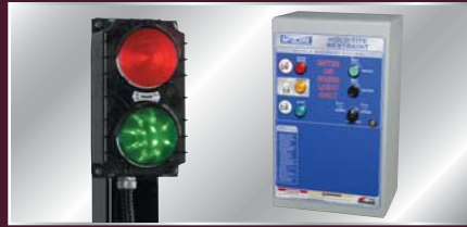
Controls are easily combined with dock leveler controls to integrate entire dock system.